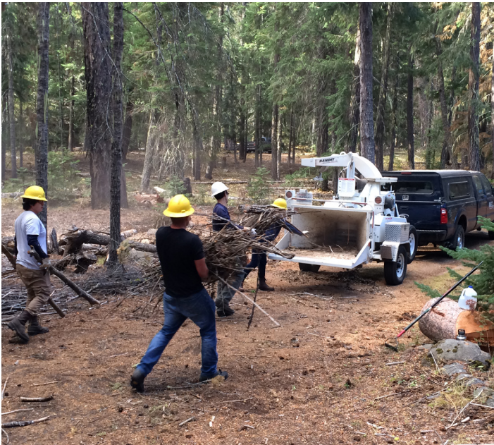
Helping landowners and communities reduce wildfire fuel, such as by hosting free mobile wood chipper events.