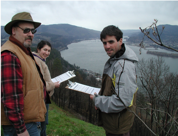
Visiting landowners' properties and developing site-specific plans that provide roadmaps of recommended actions to conserve natural resources.