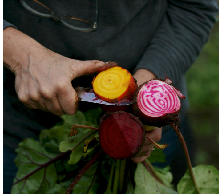
Creating new opportunities to give all people access to fresh, locally grown food, such as by launching virtual farmers markets and hosting farm stands.