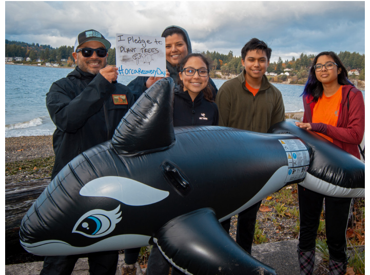
Building community awareness and engagement with priority natural resource issues, such as by hosting annual Orca Recovery Day events.